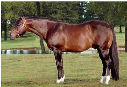
Zips Chocolate Chip AQHA