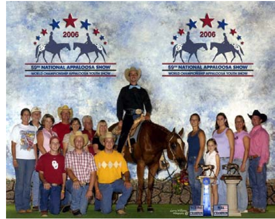
Hand Me Your Chips