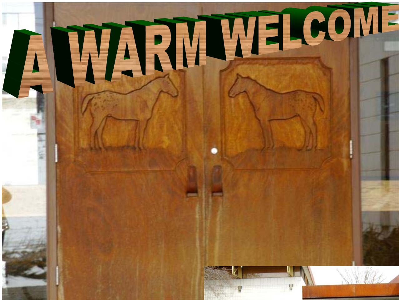
Above is a close up of the detail on the doors to the main entrance of the headquarters of the Appaloosa Horse Club in Moscow, Idaho, which is also pictured from a little farther back on the right.