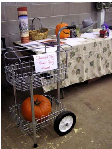
The Silent Auction Table held many treasures!