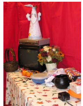
The Hospitality Room shows off its fall colors at the October Show.