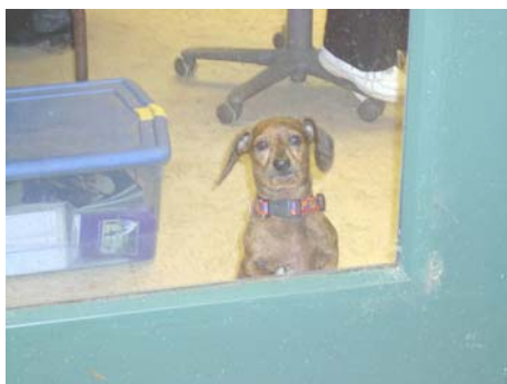
Chipper stands guard at the show office door.