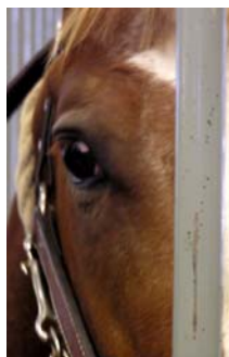
“Jail-horse Mack” and “Chipper the Marshall”