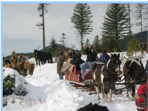
The Hatley sleigh ride being enjoyed by horse owners of all breeds.