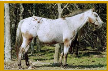
MISS LBS HAZ TO GO Is being bred to All Hands On Zip (ApHC) for a 2009 foal.