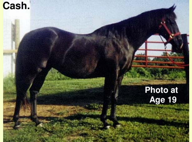
Photo at Age 19