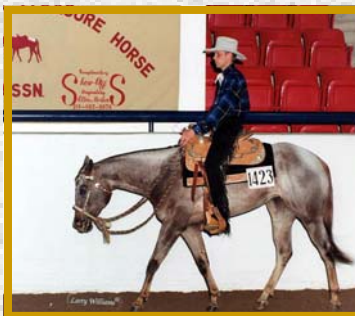
FROST MY ASSET Is being bred to Ziprageous (AQHA) for a 2009 foal.

The foaling stalls will be quiet in 2008, but will once again see action in 2009