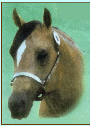
Honeys Bit Ole Lark AQHA