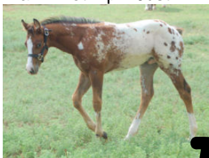
Splash (ApHC Registration Pending) – 2006 Paint Blazin Hot Tip x Just In M' Thoughts