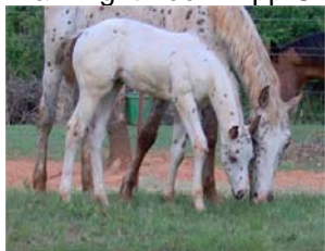
Zippin Thru Moolah – 2006 Leopard Filly Dial Bright Too x Zipp O Rhythm