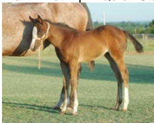
Jazz (ApHC Registration Pending) – 2006 Bay Characteristic Filly Blazin Hot Tip x Quick Statement