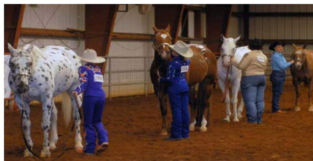
A diverse group of horses and exhibitors line up for judging in the ApHC Most Colorful class